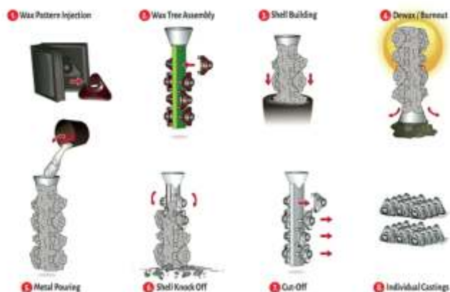
Fig 2 Various Steps in investment casting

then fired at a temperature over 1100°C to remove the remaining wax and to strengthen the ceramic mold. Before the metal is poured into the ceramic mold or “shell”, the mold is preheated to a specific temperature to prevent the molten alloy from solidifying or “freezing off” before the entire mold is filled. Then the molten metal is poured at a temperature of over 1600°C into the ceramic mold. The next step is the cooling process. The natural cooling process is carried out at temperature of 25°C, after which the ceramic mold is broken away. Ceramic mold removal can also be accomplished chemically, using a heated caustic solution of either potassium hydroxide or sodium hydroxide, but this approach is being phased out due to environmental and health concerns. Then, the orthodontic bracket is cut from the tree form. A chemical cleaning process removes the remaining ceramic slurry, using a HF Chemical solution, followed by an ultrasonic cleaning process to achieve the final smooth casting result. The last stage is the geometric and surface roughness analysis, conducted by using a digital microscope.