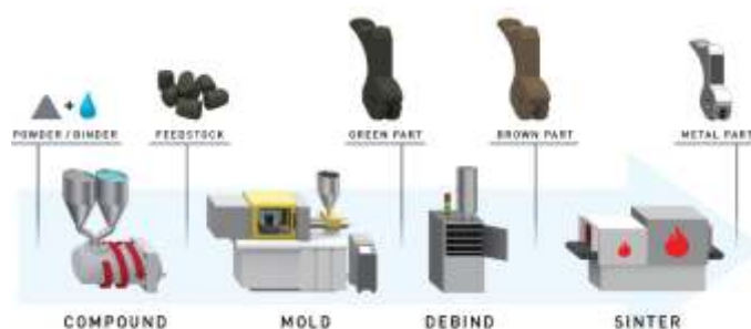
Fig. 3 various steps in bracket manufacturing using MIM technique

transformed into “brown parts,” preserving the same size with a quite porous structure. The final stage of the MIM process is sintering, which is performed in a high-temperature furnace under vacuum or a controlled atmosphere. In this stage the residual binder is removed, and at the end of the process the parts have shrunk by 17–22%, reaching the precise desired dimensions. In certain cases, thermal or surface treatments are also required.